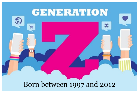
Digital natives with a strong awareness of social issues.

Especially in a society where men feel increasingly alienated and families are fractured, the “serious” church offers more than doctrine. It offers a cadence to life, an intergenerational civil society, and a place to nourish the soul. With it comes an escape from cultural nihilism present elsewhere in their lives. This renewal, however, is not self-sustaining and requires real work. If Gen Z's encouraging spiritual seriousness is to continue, then churches aspiring to win the hearts of younger people must offer more than Instagram sermons and platitudes. Rather, they must provide a package of formation, beauty, discipline, and truth. Gen Z has been remarkably resilient thus far and may just go a long way toward healing the cultural sins of the recent past.