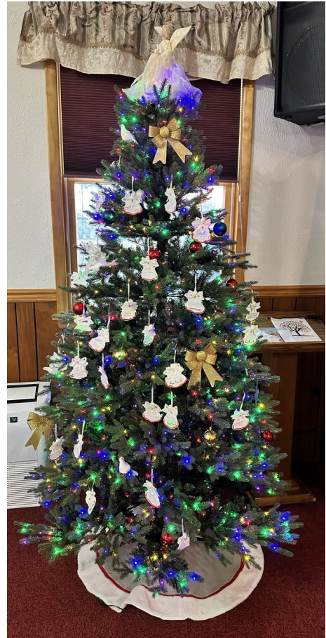
Sanctuary Christmas tree

Amelia Conley— decked out for Christmas!