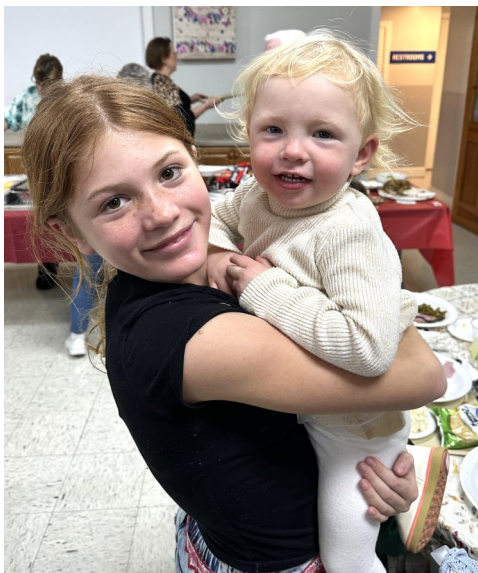
Sky and Rand