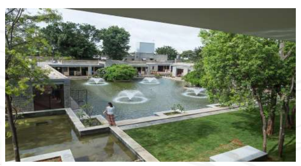
The Abode of Compassion