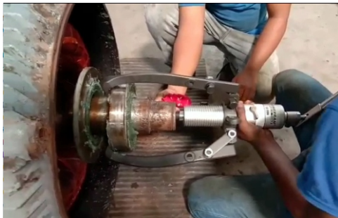
Application of PM- Series Puller