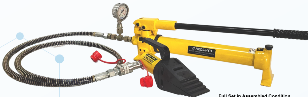
Full Set in Assembled Condition