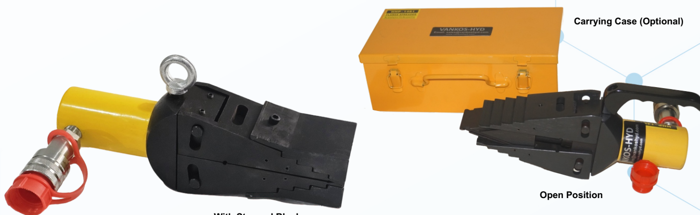
Carrying Case (Optional)