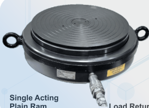
Single Acting Plain Ram