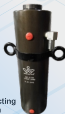
Double Acting Plain Ram