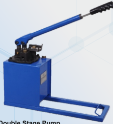
Double Stage Pump WP : 700 BAR