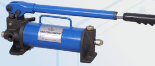
Single Stage Pump WP : 700 BAR

Single Acting, Double Acting Pressure Range : 350-2800 BAR