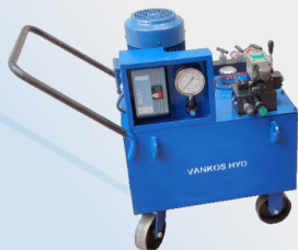
Electric Single Acting Power Pack