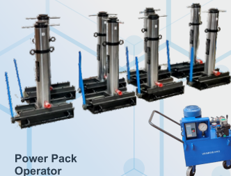
Power Pack Operator