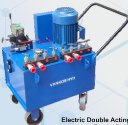
Electric Double Acting Power Pack

Single Acting, Double Acting Pressure Range : 350-700 BAR