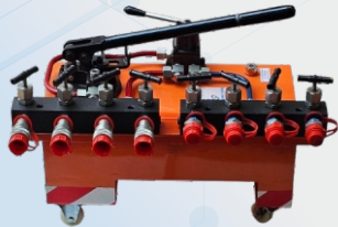
Double Stage Pump Double Acting with Manifold WP : 700 BAR