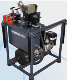
Petrol Power Pack