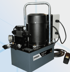
Electric Power Pack with Solenoid operation