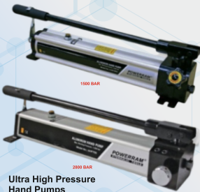
Ultra High Pressure Hand Pumps