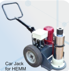
Car Jack for HEMM