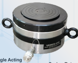
Single Acting Threaded Ram