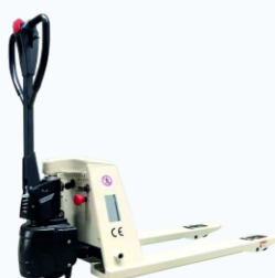
Pallet Truck (Manual and Electric)