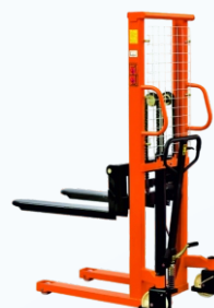
Stacker (Manual and Electric)