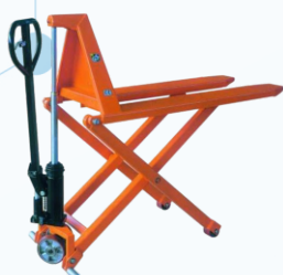
High Lift Pallet