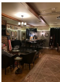
The KC Wine and Whiskey Room available for all our member events

*all membership payments subject to 2.5% fee if paid by credit card)