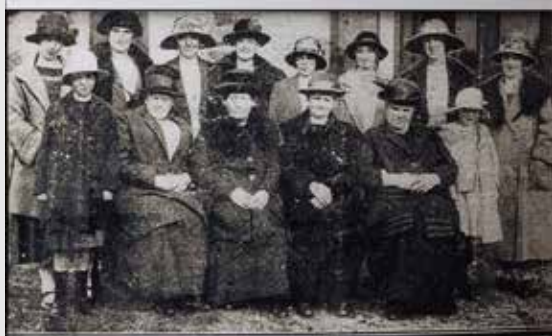
Ladies who assisted at the opening of the Institute