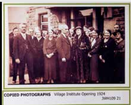
COPIED PHOTOGRAPH Village Institute Opening 1924