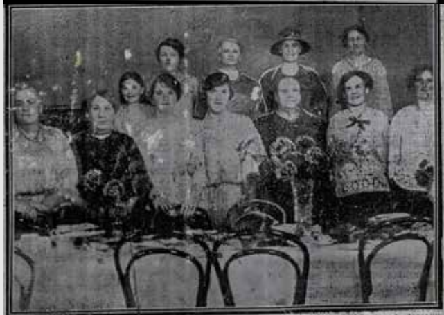
Ladies who presided at the tea table.