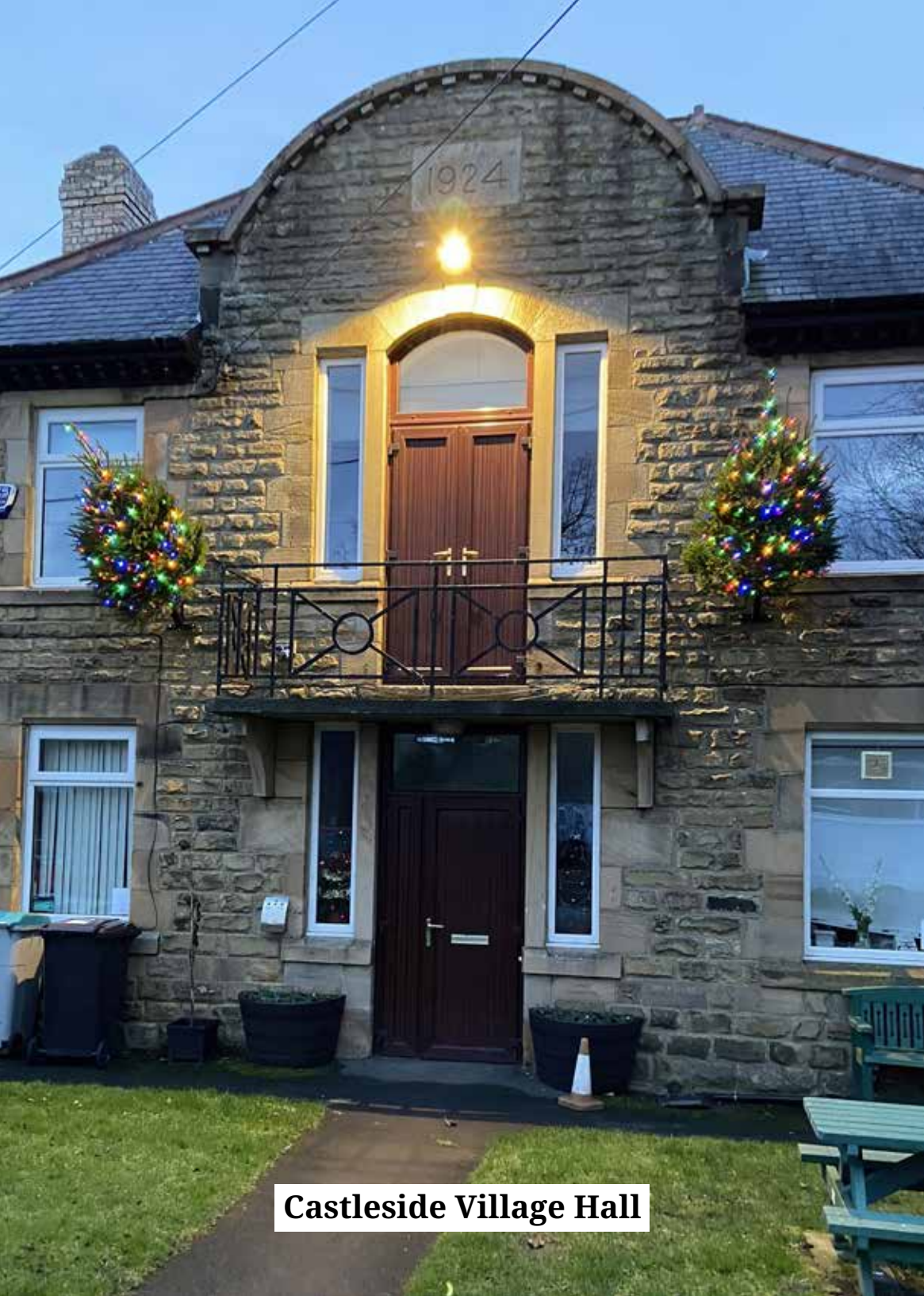
Castleside Village Hall