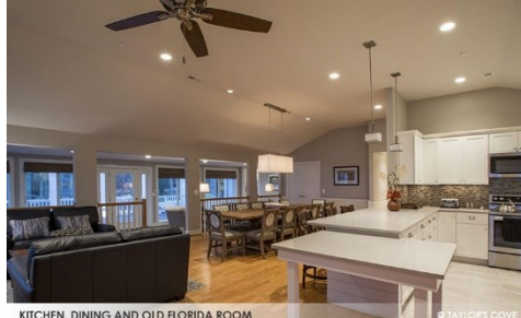
KITCHEN, DINING AND OLD FLORIDA ROOM