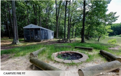
CAMPSITE FIRE PIT