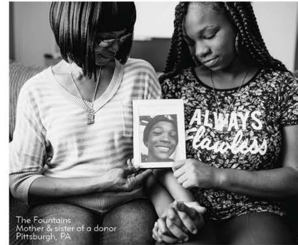
The Fountains Mother & sister of a donor Pittsburgh, PA