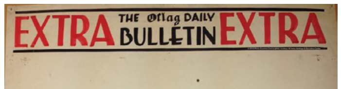
The Oflag 64 POWs hand-lettered this masthead for their daily news-sheet. U.S. Army Heritage & Education Center. Photo Susanna Bolten Connaughton.