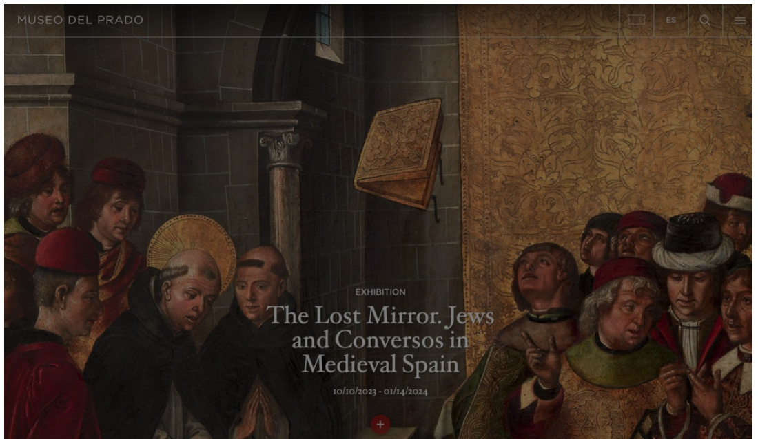
Go to museum web site