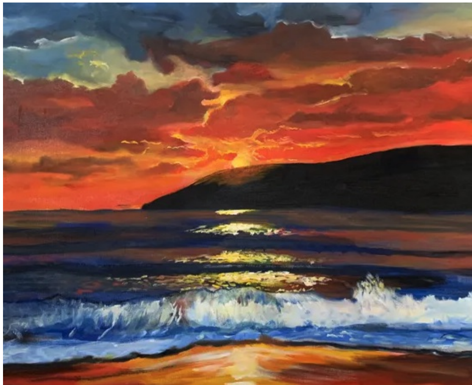
3S Art Oil Painting