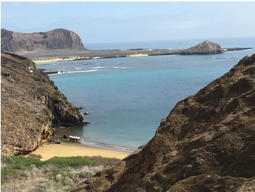
Video story of the Galapagos Islands

The Galápagos are so unique; different than anywhere else in the world. The islands are basically inhabited only by its unique animals with no humans on many of them. Some areas are frozen in time, the same as the day Darwin stepped foot there.