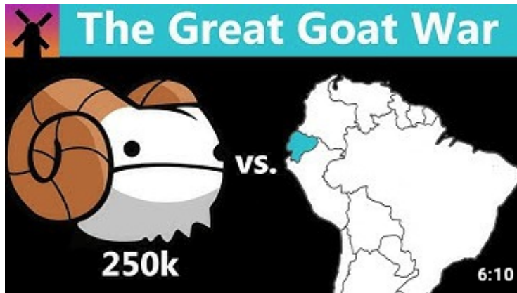
Killing of the Gallapagos Goats