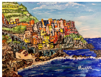
Watch video - Creating an oil

Click here to see an oil painting by Anthony Russo in its various stages of completion. The "Jersey Shore Happy Painter"