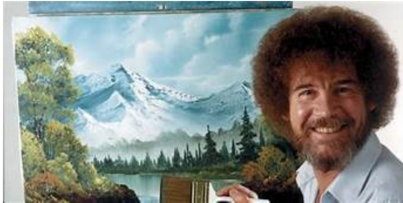
Video about the life of Bob Ross the "Happy Painter" (Click on picture above)