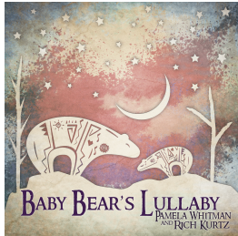
Baby Bear's Lullaby music and art video