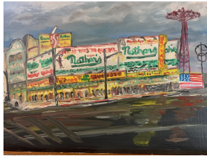
Purchase an Original Oil painting $75