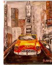
Purchase a 11x14 matted print