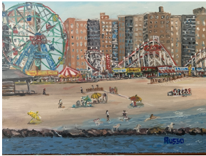
Click here to purchase Coney Island oil painting print