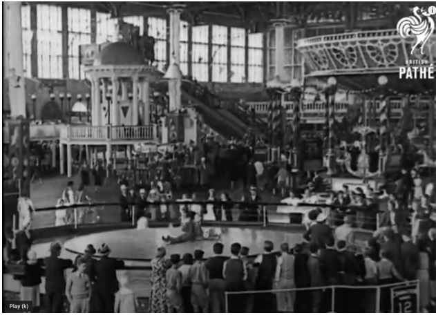
Steeplechase Park video

or riding the rides like; the Steeplechase horses, the Cyclone, the parachute jump, the Wonder Wheel, the bumper cars, the Bobsled, the parachute jump or a trip to Coney Island Aquarium.