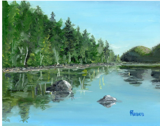
Jordon's Pond in Acadia National Park, Maine