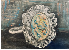
Go to 3S Art