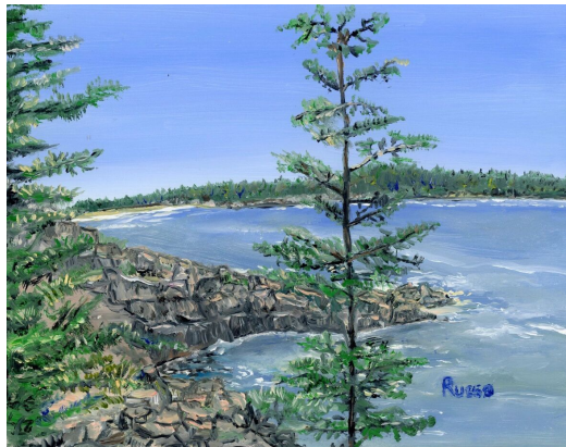
Acadia National Park - Sand Beach