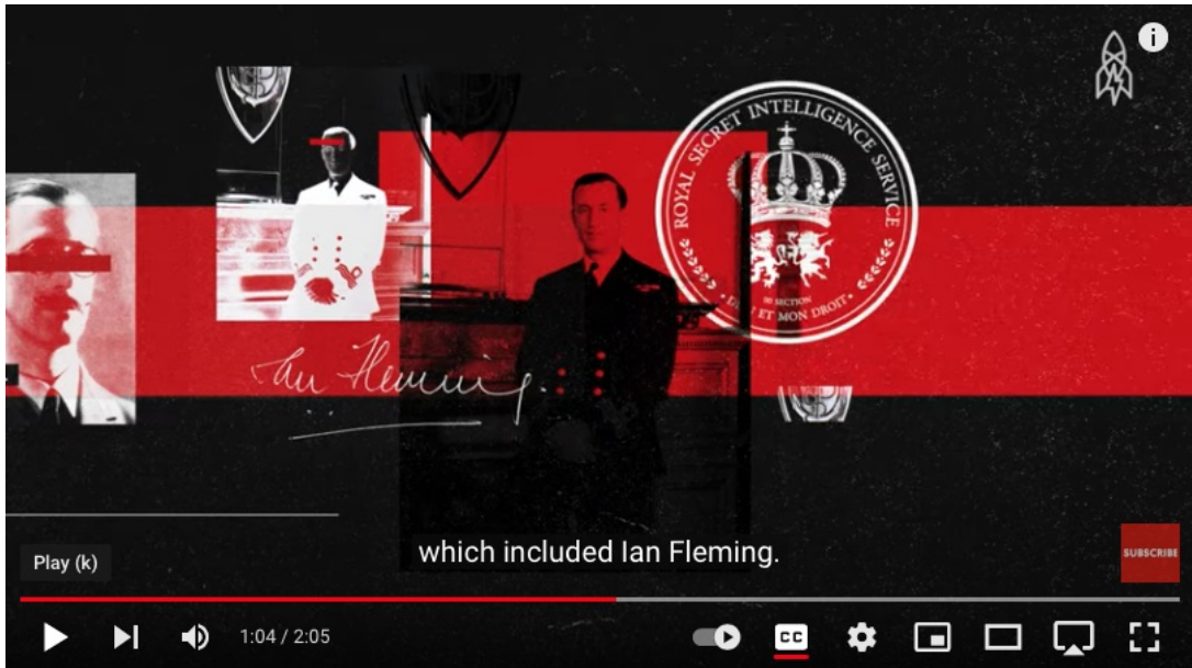
Operation Mincemeat (Summary video)