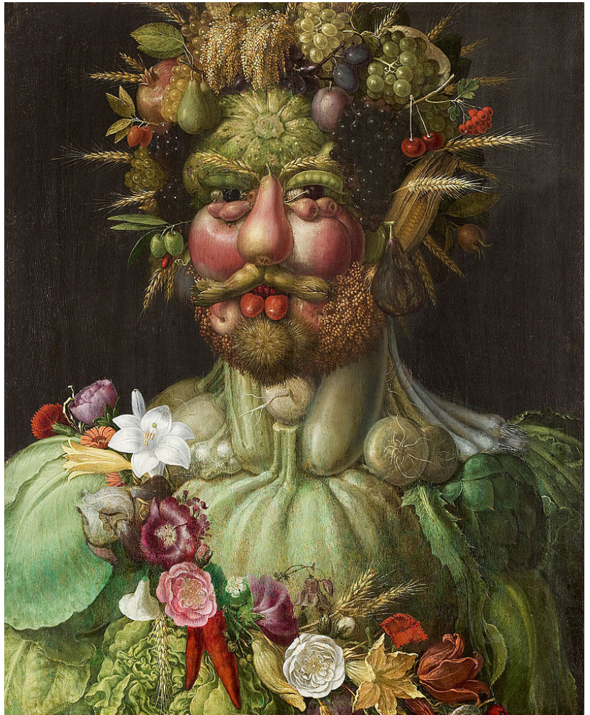
Top 10 Art masterpieces with food

Top 10 Art masterpieces with food as the subject