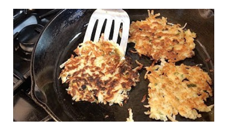
Potato Pancake recipe