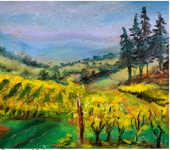
Pastel on 3S Art website