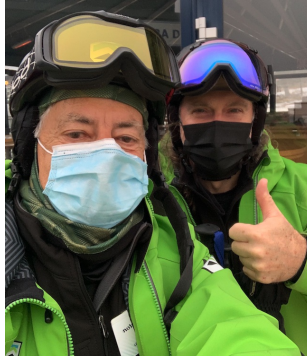
Killington Ambassador Program

Clearly, the beauty of the Green mountains have spurred the creative talents of many musicians and artist.