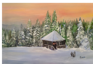
Go to 3S Art Shop