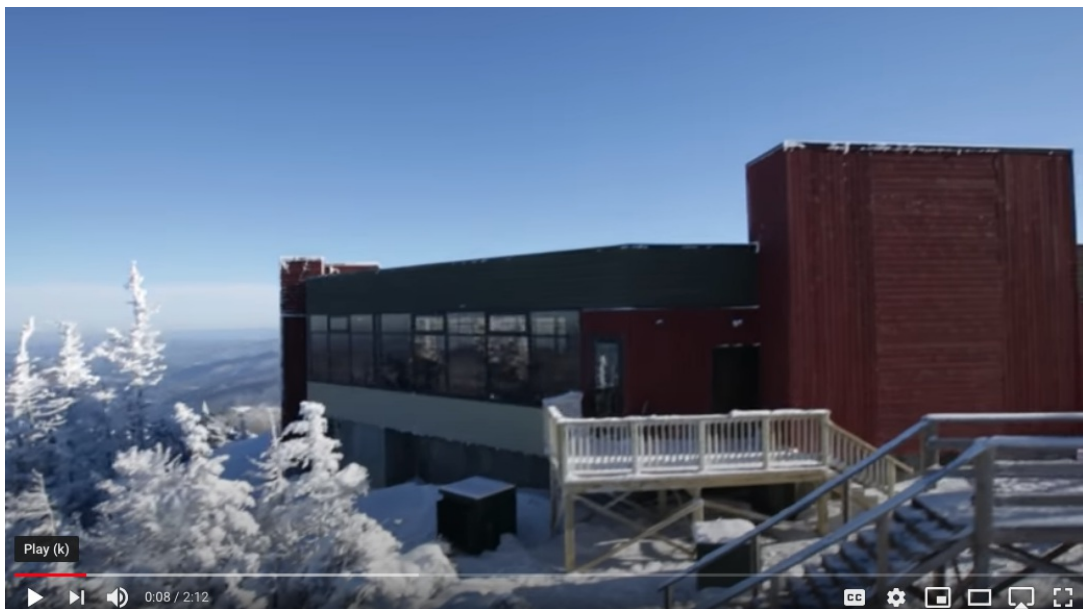
History of Killington Ski Mountain