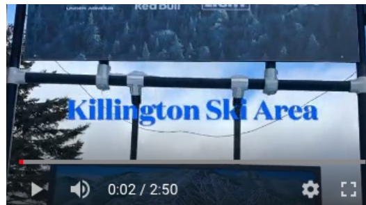
Inspirational photography music video