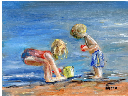
Go yo Shop