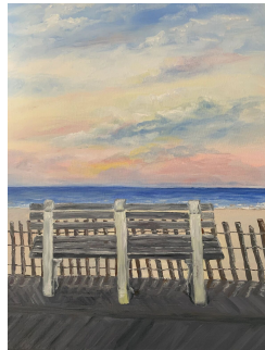
Go to Shop