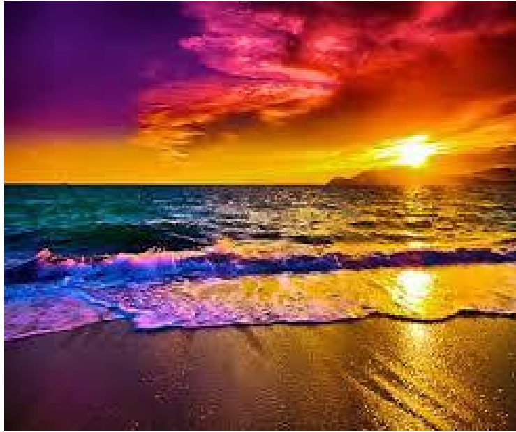
Time Lapse videos of Sunsets

mountains. Maybe take out your iPhone and capture the moment!