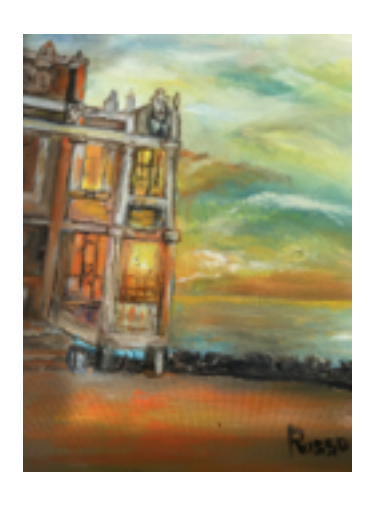
Go to 3 Sart