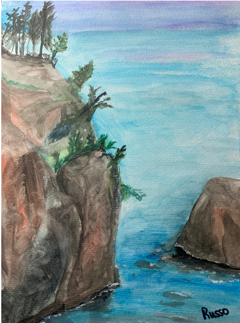
Acacia watercolor painting