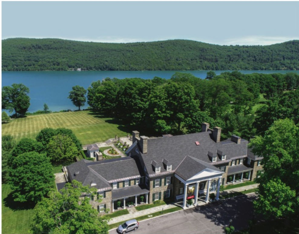
Fenimore Art Museum