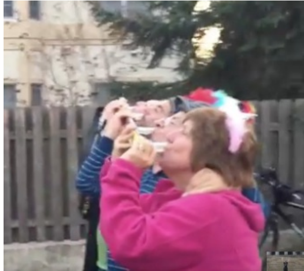
(Click) Instructional video

What is the one thing every good garage bar should keep available for parties?