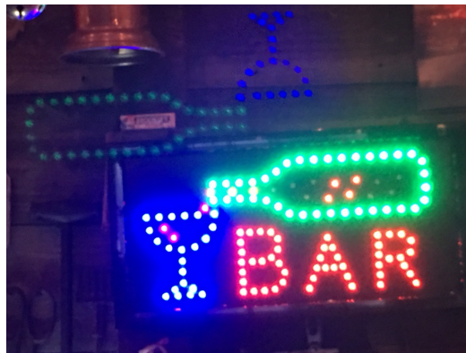
(Click) See the bar lighting

An unusual combination - I hung these items on the walls, in the ceiling and almost any available space in this two car garage. I then decided I needed special lighting. I had to rewire the entire garage to include, a wide screen TV, surround sound, disco lights, strobe lights, laser lights and a disco ball. Ahhhh, perfect combination for a unique experience of the old and the new. Also, a pretty cool place for parties or to watch a soccer or baseball game and have a cold one or two.