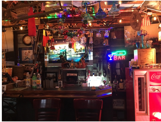
(Click) More bar lighting