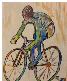
Go to 3S Art Shop