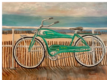
Go to 3S Art Shop