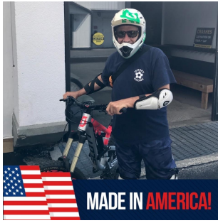
Get out and bike

I just purchased my own e-Bike and it just arrived. I bought the City RAD step thru bike . I can't wait to hop aboard and cruise longer and further. I don't care if someone says I'm cheating! I plan to just enjoy the ride and the scenery along the way.