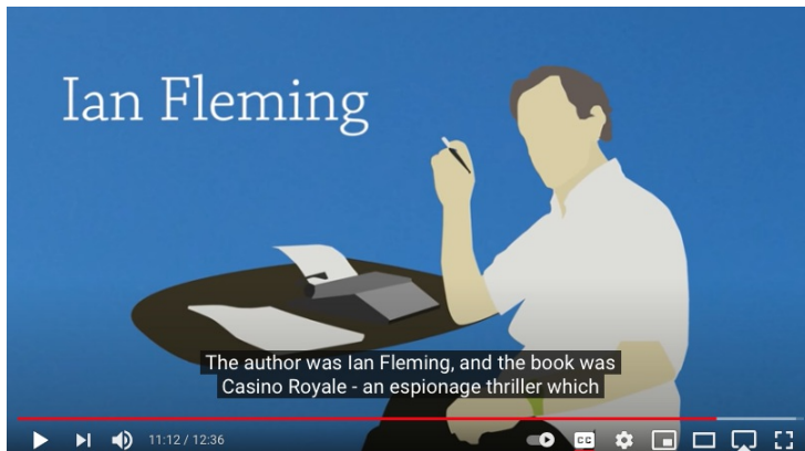
The story of the Ghost Army (Watch trailer 2 minutes)

Ian Fleming - the James Bond author developed a plan of deception to fool the German Army in WW II