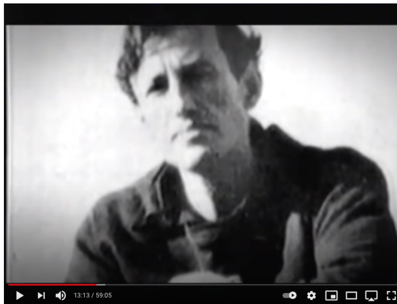
Bio of Ian Fleming (Video)

A BBC documentary tells the story of Ian Fleming) and the origins of James Bond (click on the photo above to view the documentary).