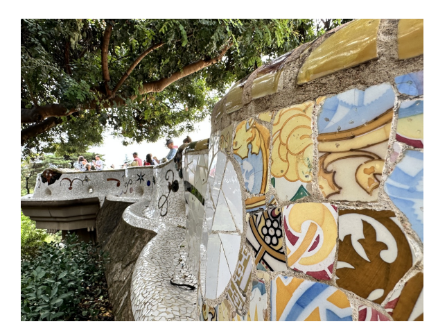
Video on more information on Spain

I hope you enjoy this video I took on my visit. Park Guell is a true work off art