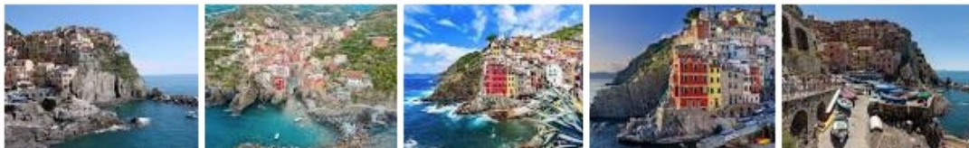
Rick Steves video on Cinque Terre

Go to 3S Art and subscribe to receive a FREE newsletter