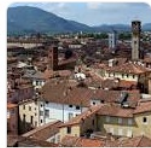
Lucca Pop. 82,000