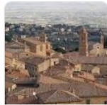
Montepulciano Pop. 14,000