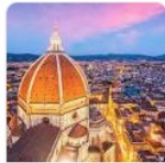
Florence Pop. 380,000