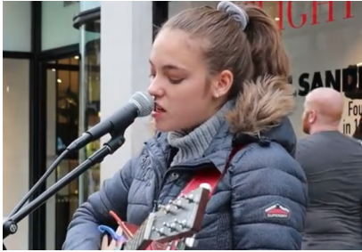
Click here for the Youtube video

**I always enjoyed the unusual guitar technique and singing style of Richie Heaven. Here is Richie Heavens (many sunsets after the Woodstock years) doing the famous Beatles classical song, "Here Comes the Sun"