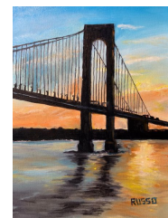
12x16 stretched canvas & black