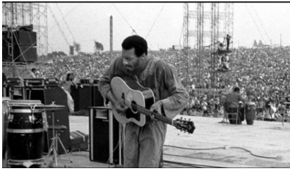
Click here for the Youtube video