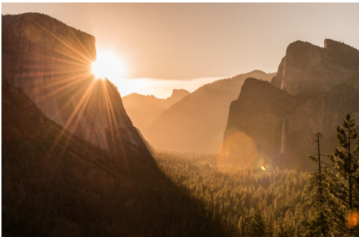
Best places in the world to see sunrises (Click here)

When you take the time to view a sunrise you get a feeling of promise and hope for the upcoming new day. At sunset, you have the opportunity to relax and reflect on the day. Sunrise and Sunset are proven mood boosters and my mood immediately soars when I take the time to experience them. Only the hardest of hearts isn't moved by their beauty.