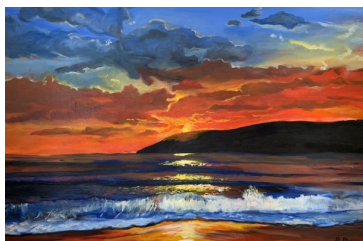
Go to Store and purchase for $75