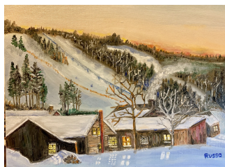
Click to purchase a matted print Only $30