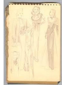
Drawings of the Ghost Army artist

(Click on the photos above to learn more about the Ghost Army)