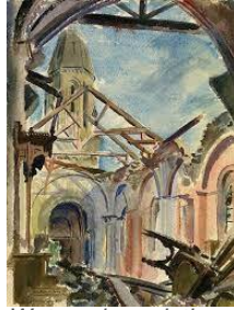
Watercolor paintings of the Ghost Army