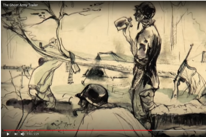
The story of the Ghost Army (Watch trailer 2 minutes)

The Art of War - The Ghost Army (Click here for Full documentary 45 minutes)