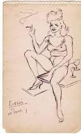
More Ghost Army Art