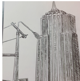
Shop - Pencil Drawing