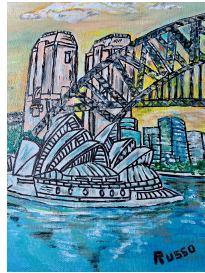
Shop - Oil painting