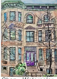
Shop - Watercolor