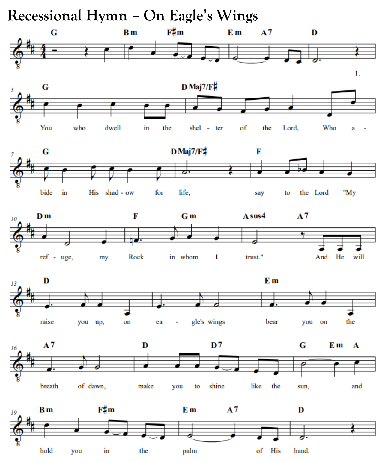
Copyright ©1979, North American Liturgy Resources Reproduced with permission - LicenSingOnline C16715