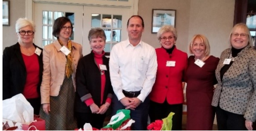
Prior Speakers from our Beneficiaries