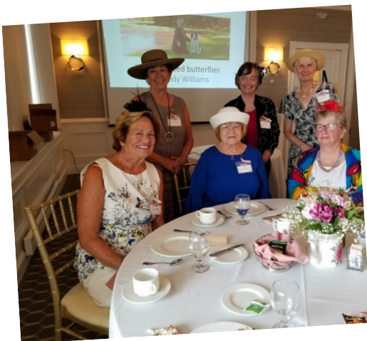
Fabulous Fascinators Ladies!