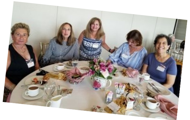
Welcome New Members!