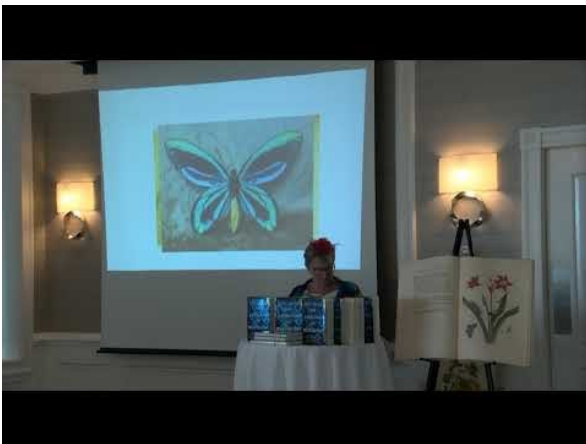
Wendy Williams, author and presenter

https://www.youtube.com/watch?v=cyeBlsRcWTY&t=14s