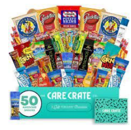
8th Grade Service Project building snack-packs for the underprivileged