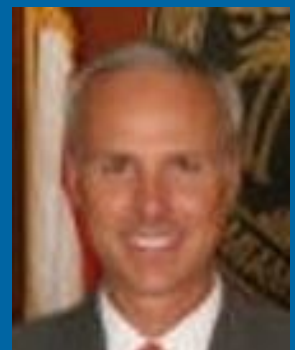
Mayor Charles W. Burkett