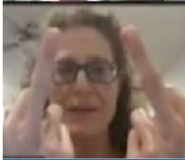
Commissioner Eliana Salzhauer during a Surfside Commission meeting