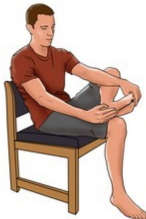
Plantar fascia massage