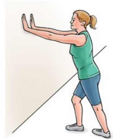
Standing calf stretch