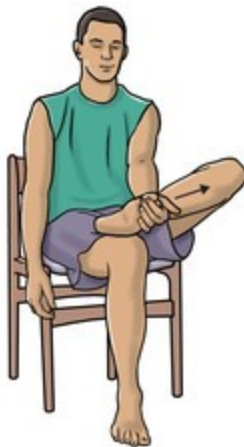
Seated plantar fascia stretch