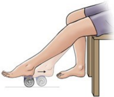
Frozen can roll