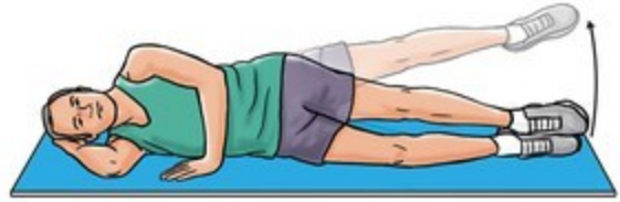
Side-lying leg lift