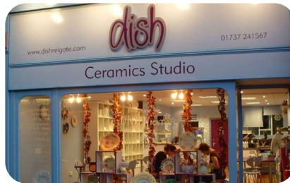
Ceramic painting in Reigate