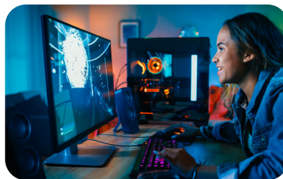
Supported online gaming