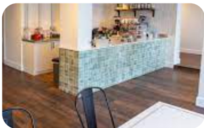
Lego cafe in Caterham