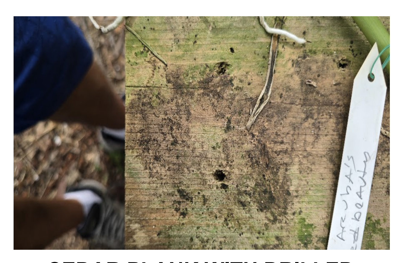
CEDAR PLANK WITH DRILLED HOLES