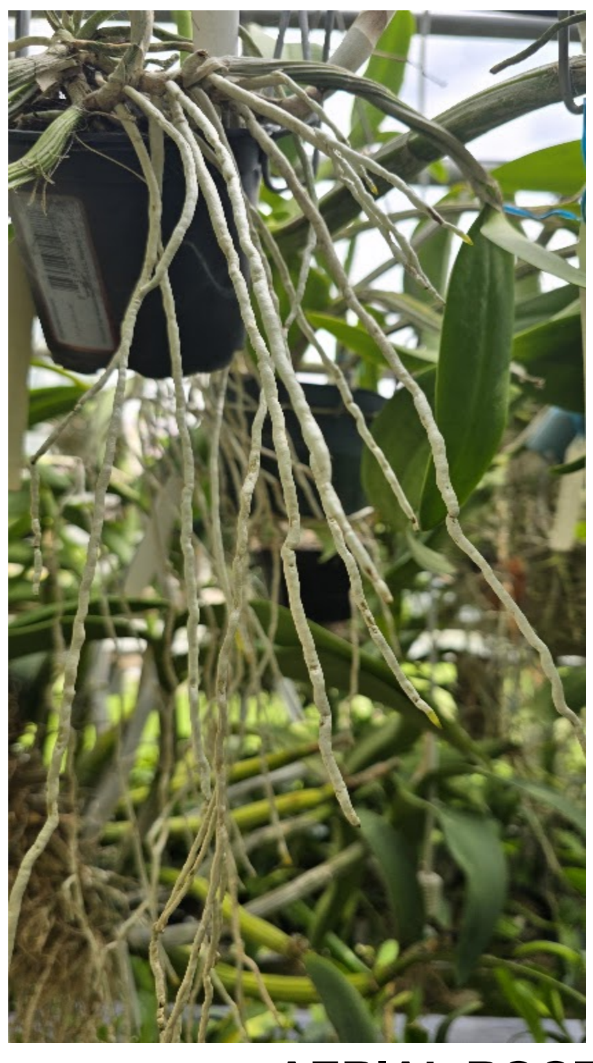
AERIAL ROOTS WITH VELAMEN TIPS