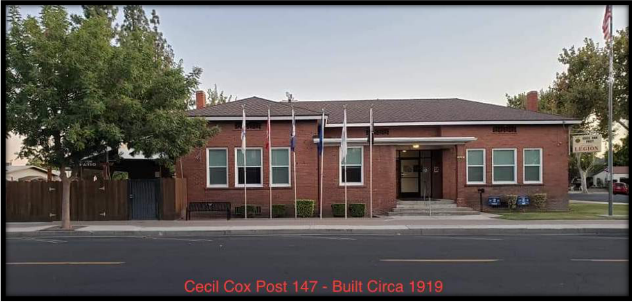
Cecil Cox Post 147 - Built Circa 1919