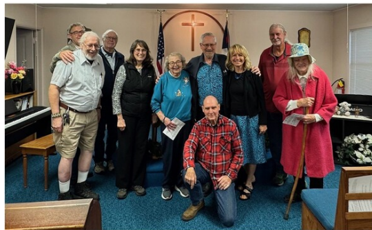
Olney Community Church - Oregon