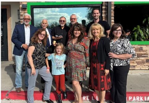
Bethel Church – Lake Jackson, Texas