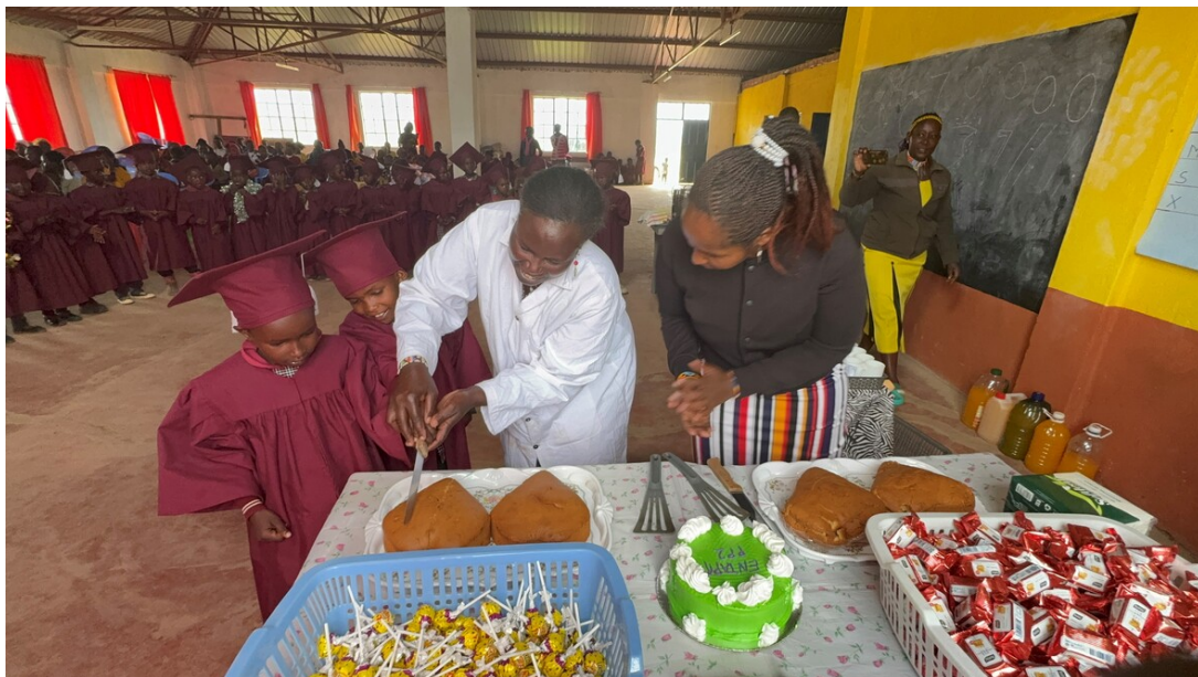
Celebrating with cake and treats!