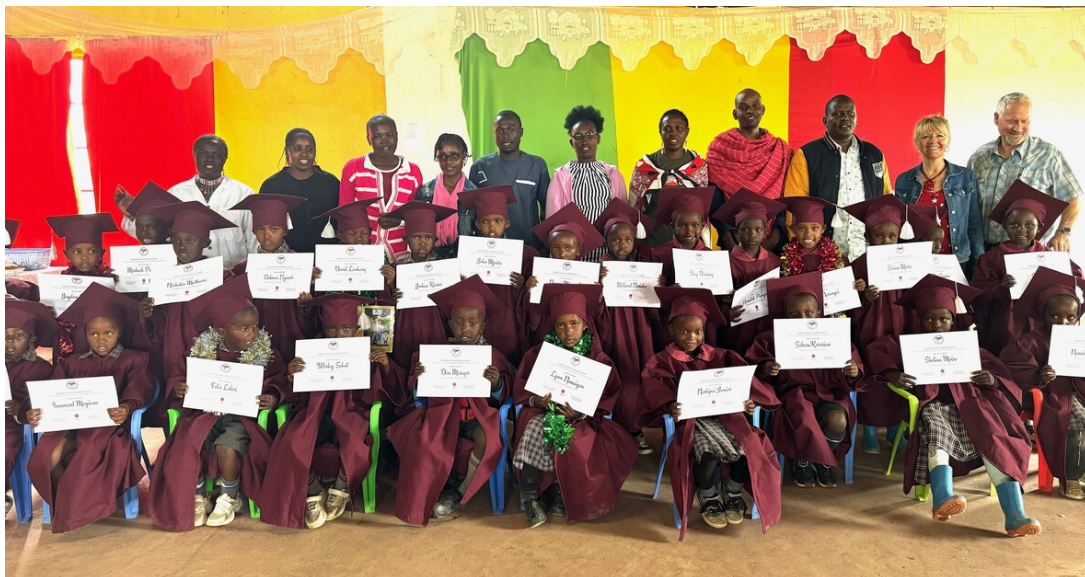
2024 Graduating Kindergarteners, Teachers, Staff, and School Board