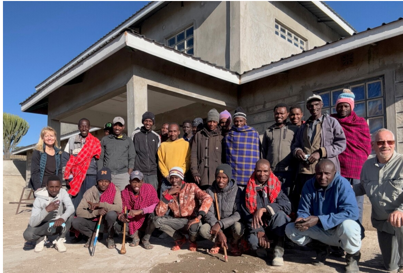
JFM BUILDING CREW