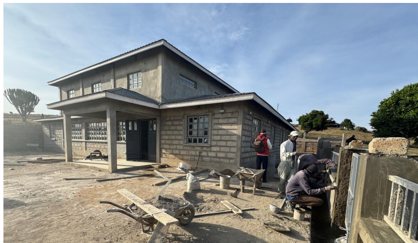
Jesus Frees Ministries Kenya- Building the Mission Center at the JFM Headquarters

And coming to Him as to a living stone which has been rejected by people, but is choice and precious in the sight of God, you also, as living stones, are being built up as a spiritual house for a holy priesthood, to offer spiritual sacrifices that are acceptable to God through Jesus Christ. 1 Peter 2:4-5