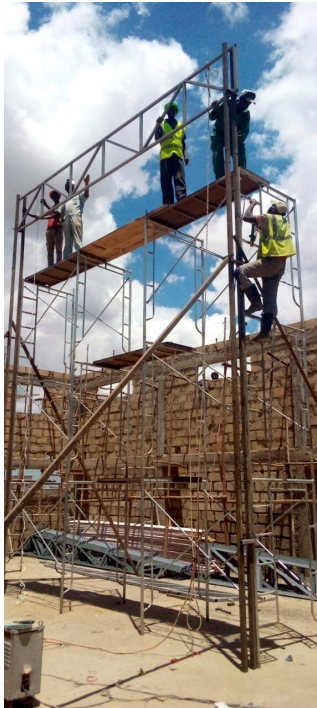
Scaffolding being erected at the JFM Mission Center