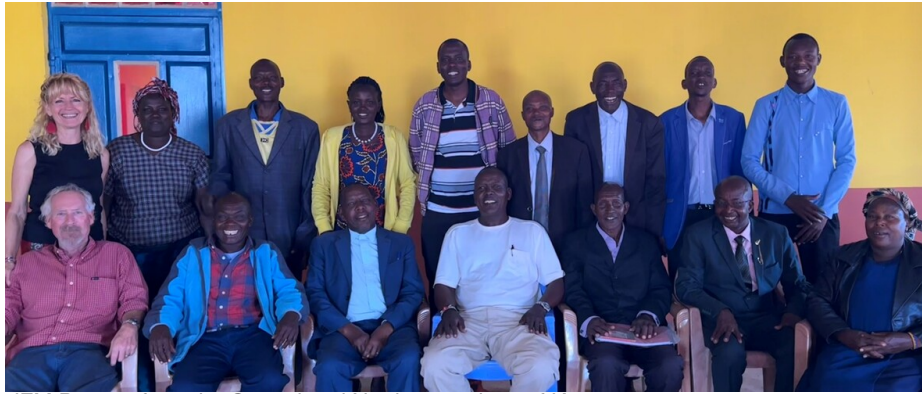
JFM Pastors from the Central and Northern regions of Kenya

These pastors survive on very little and this fund is a tremendous blessing to them.