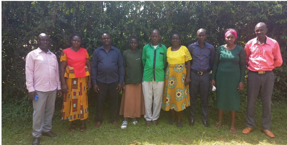
JFM Pastors from the Western regions of Kenya

In December we mentioned four children who needed help. Praise the Lord for the family who wanted to sponsor these four less fortunate children! "Jesus loves the little children of the world."