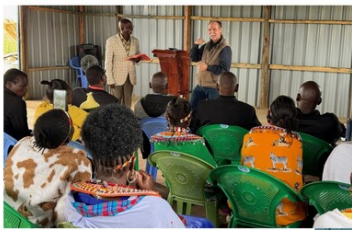
JFM KISIMA CHURCH