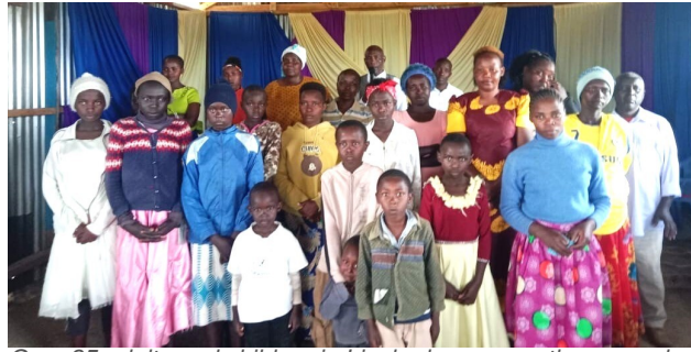
Over 25 adults and children in Liasho have recently responded to the Gospel.

It's powerful to know that our Heavenly Father watches over us, and even in a challenging year, we find peace in the fact that He cares for us and knows what is best. A scripture that comforts in trying times is Philippians 4:6: "Don't worry about anything; instead, pray about everything. Tell God what you need, and thank him for all he has done."