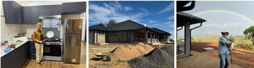
With only a few boxes unpacked the Missionary Home has already become a ministry hub! The day of the big move we were thankful to see God's rainbow.

This week we are giving thanks to the Lord for the occupancy certificate for the permanent JFM Missionary Home!