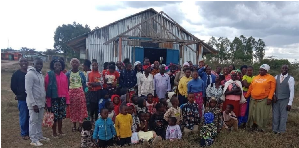
JFM Liasho Church is growing!