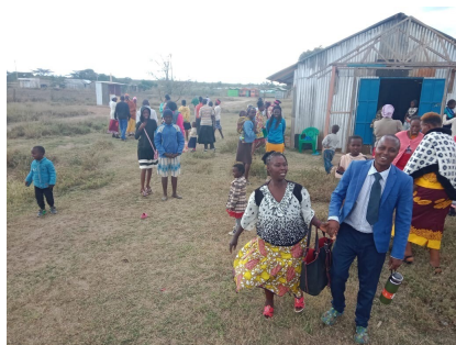
Brothers and sisters headed home after the service in Liasho.

In recent weeks, over 25 adults and children in Liasho have responded to the Gospel.