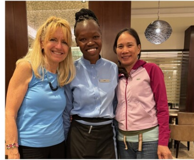
Sharing the "Truth" with Sella

Several workers building the JFM headquarters are now teaching the morning discipleship devotions. We rejoice that they have grown in the Word of God and are now discipling others!