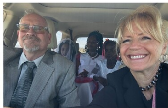
Transporting the Bride