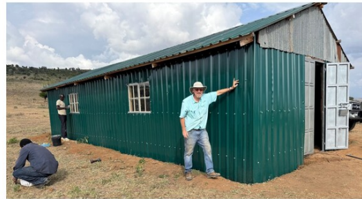
The new JFM Katunga Church building!