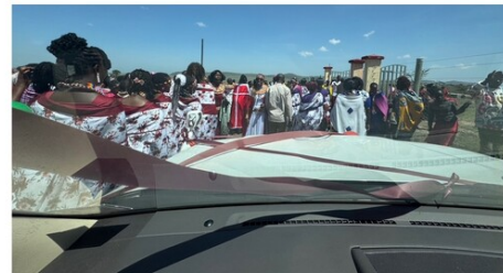
Welcoming the Bride to her special day