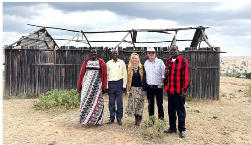
The old church building was destroyed in a windstorm.