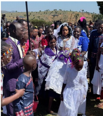
Fetching the Bride