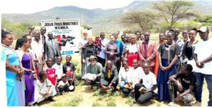
The congregation of the JFM Wamba Church