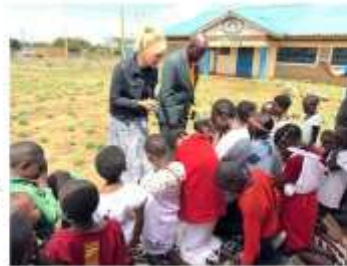
Many children responded to the Gospel

Our JFM-sponsored Entapipi Primary School is doing GREAT!